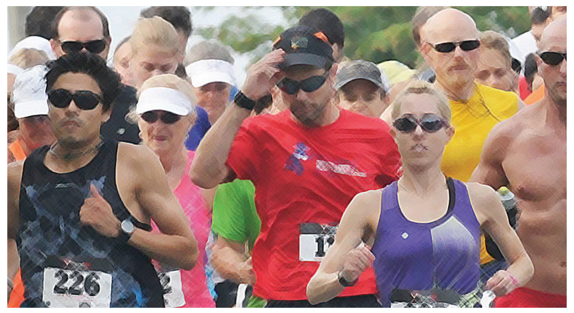
RUN for a GREAT CAUSE! All proceeds benefit the Residents of the Seacoast Nursing & Rehabilitation Center.